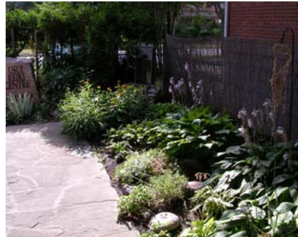
The garden at Reiki House

The remainder of Ontario’s flowering plants were introduced intentionally via European settler introduction, or accidentally via imported dirt, or long distance forms of transportation such as trains and ships.